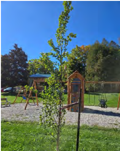
Birch tree in memory of Connie Neelands