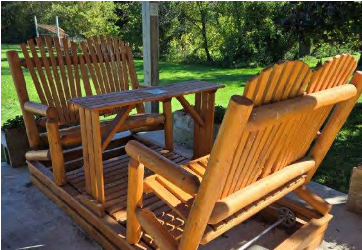
Gliding bench dedicated to the memory of Andy Neelands